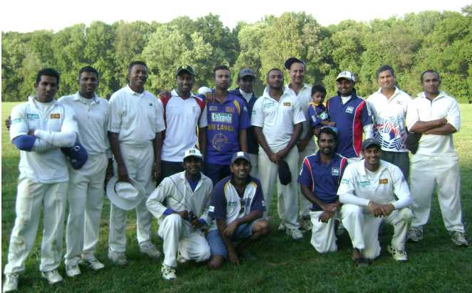
Continental Cricket Club – 2008

For further details and statistics check out: www.wclinc.com